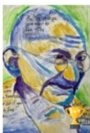
Be The Change You Wish Noah Shah Watercolours and Pen, 29cm, 21cm